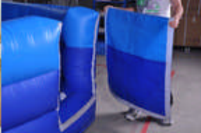
You may take the front door to the printer and have your name and number printed onto it. Velcro is great.