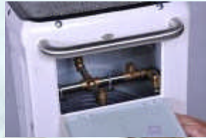
easy access to sprayer tips