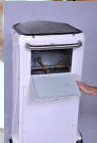
wide shot of sprayer tips and easy access door