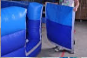
removable front door to Bubble Pit