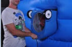
Bubble Blaster 3000 is portable and easy to handle