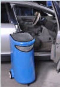
it fits nicely into the front seat of a 4-door car