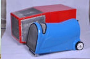
Notice the size difference