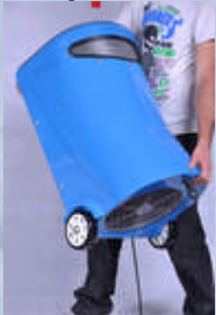
Bubble Blaster is easy to transport