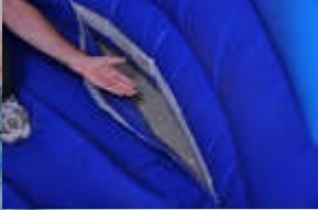
Removable water tight floor from Bubble Pit