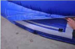
quick air release from Bubble Pit