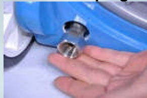
water hose attachment