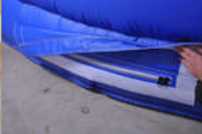
Heavy duty velcro and a zipper to allow air release quickly