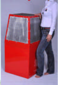
Bubble Blaster 7000 Foam Machine is huge and impressive