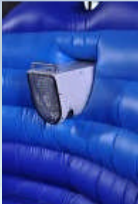
front view of Bubble Blaster 3000 inside of bubble pit