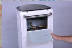
sprayer tip access