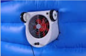
rear view of machine inside of bubble pit